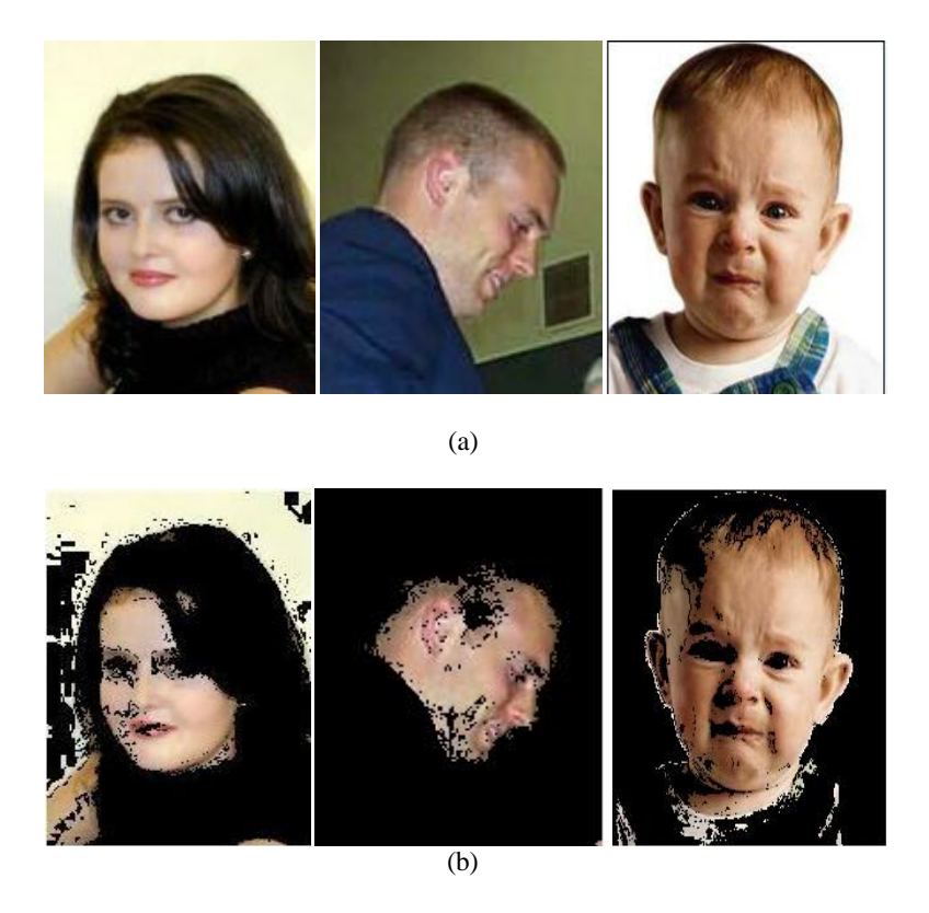
Fig.3. (a) input image, (b) detected skin pixels